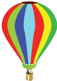
Hot air in balloon